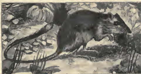
FIG. XXXVI. DIPODOMYS MERRIAMI . MERRIAM'S KANGAROO RAT.